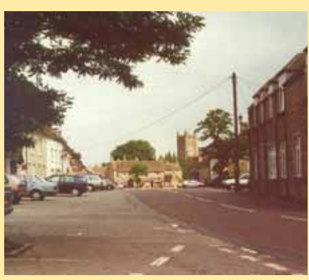
Sherston High Street

not just from plans developed by Parish and Town Councils, but also from the inputs invited directly from local businesses, service providers, voluntary organisations, faith communities, youth representatives, school councils and interested members of the public.