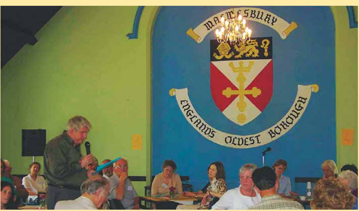
Assembly of Malmesbury and the Villages on 15 May 2004.

Chair of the Core Group for Developing the Community Plan